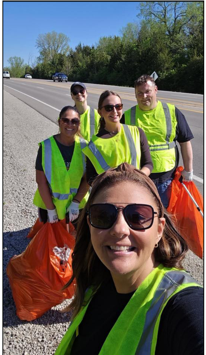
EARTH DAY CLEANUP. Ottumwa Noon Lions pick up trash along Highway 149/Business U.S. 63 during the Worldwide Week of Service for the Environment in April.

WILLIAMSBURG KidSight screened 46 preschool children.