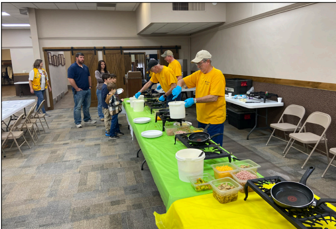
BREAKING EGGS. Marcus Lions prepare made-to-order omelets at their annual fundraiser.