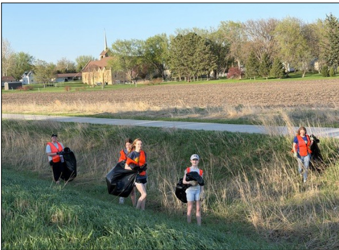
ROADSIDE CLEAN UP. Badger Lions and community members clean up ditches along the roads in and near Badger.