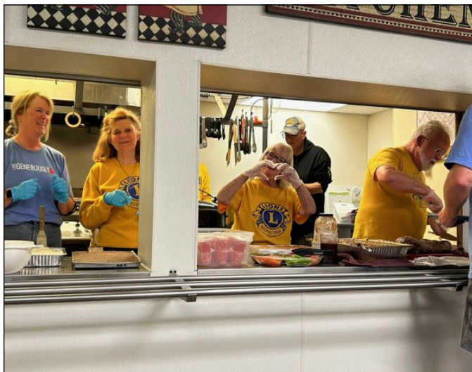
GETTING READY. Badger Lions hard at work in the kitchen prepping for their spring pancake breakfast.

As you continue forward into new projects, new challenges, and new opportunities to serve, may you find fair winds and following seas in every journey to come.