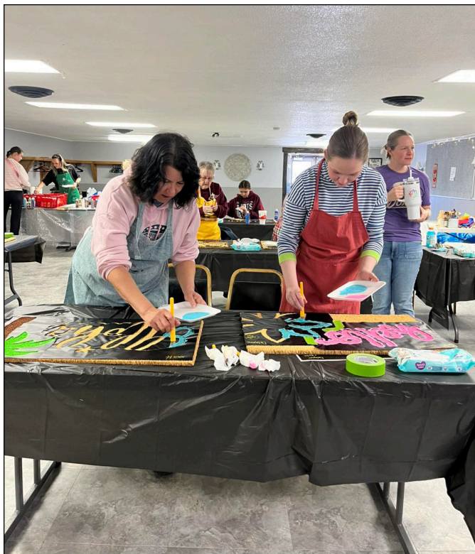
PORCH PROJECTS. Community members make door mats and porch signs at a fundraiser hosted by the Melcher-Dallas Lions Club to raise money for the Melcher-Dallas Dollars for Scholars scholarships.

VICTOR screened 64 children at three preschools in the Victor area.