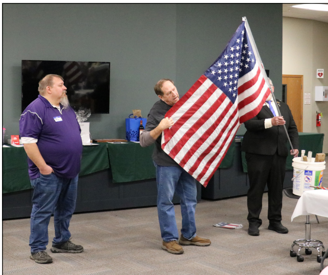
PROJECT IDEA. Lions give a presentation on getting a community flag project started.