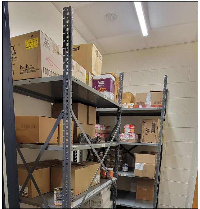
FOOD PANTRY AID. Members from the LeClaire Lions helped fill two shelving units at the Pleasant Valley Junior High and three shelving units at the Pleasant Valley High School for a new Food Pantry.

WEST BRANCH worked at the concession stand at Carver Hawkeye Arena; had two eye tissue transports; hosted three Pickle Ball events.