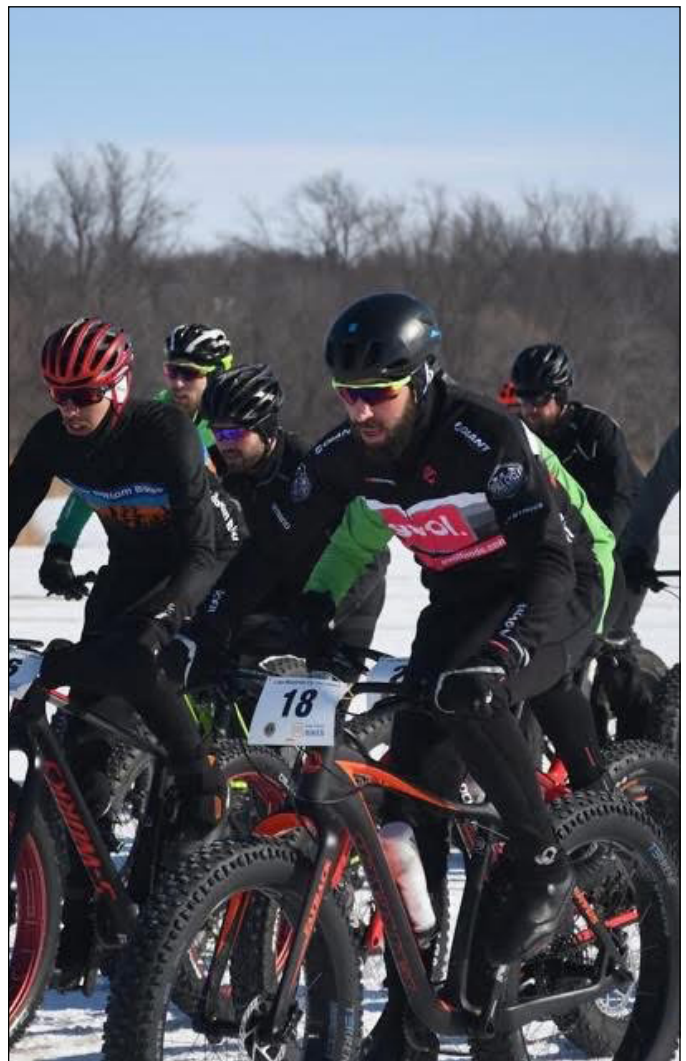
FAT TIRE CLASSIC. Cyclists start their ride at the 9th annual Lake MacBride Fat Tire Classic hosted by the Solon Centennial Lions Club in February. The club raised $10,500 at this year’s event.

As I told the Leos, we all need to visit the Lions International website . There is a wealth of information on the site and a lot of great training available. Please take advantage of this free information to help you and your club.