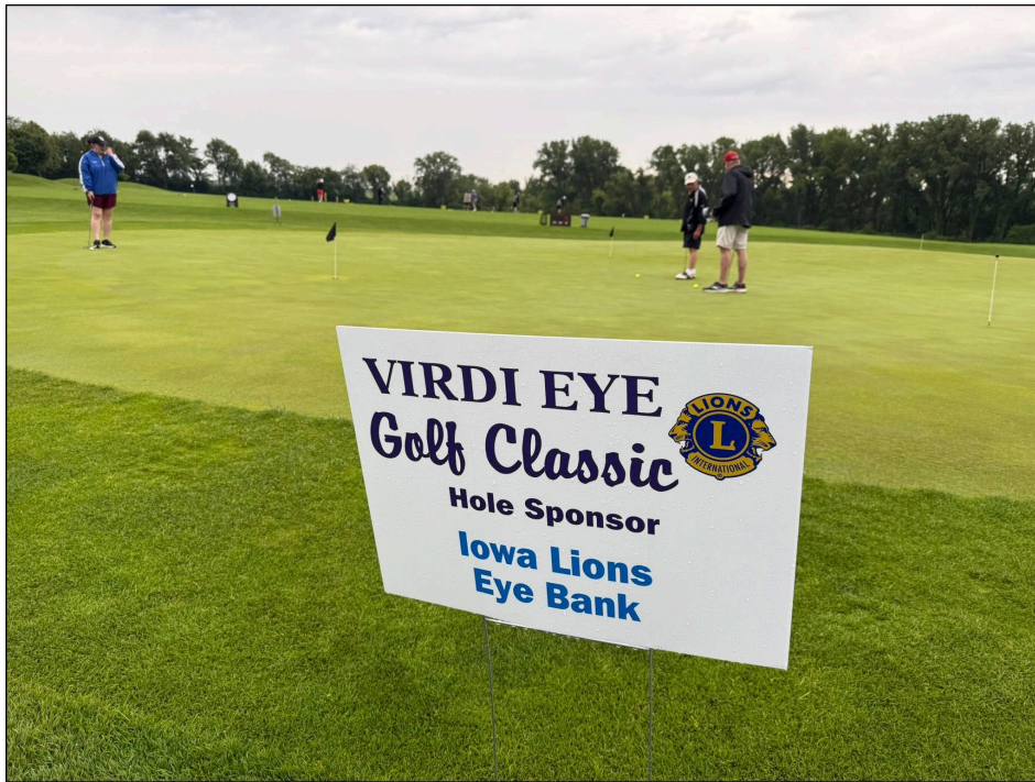
GOLF CLASSIC. The team from the Iowa Lions Eye Bank takes to the green on their sponsored hole at the 2025 Virdi Eye Golf Classic. The annual tournament in District 9EC is recruiting sponsors and golfers for the 2026 event.