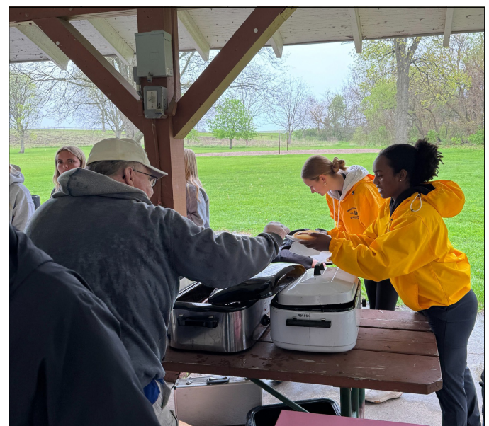
FEEDING THE MASSES. Altoona Lions serve hamburgers and hotdogs to Southeast Polk High School seniors during the school's annual Senior SCIP Day.