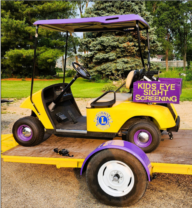
NEW RIDE. Low Moor Lions decked out a golf cart to use in parades. They even painted the trailer in matching Lions' colors.