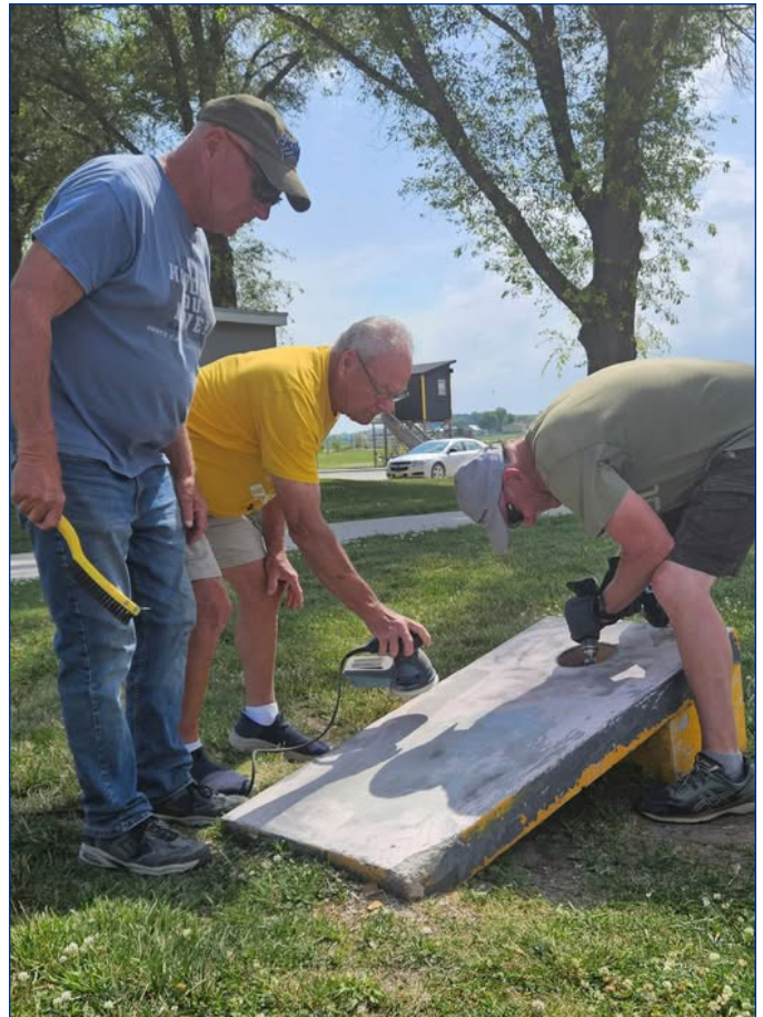
WANNA PLAY SOME CORNHOLE? Neola Lions repair the Lions Cornhole platforms at the Neola City Park.

A shoe drive fundraiser collects new or gently used shoes and sneakers to support our mission of turning donated footwear into funding for global anti-poverty initiatives. By participating, donors promote recycling and help provide shoes to those in need, reinforcing environmental responsibility and community support.