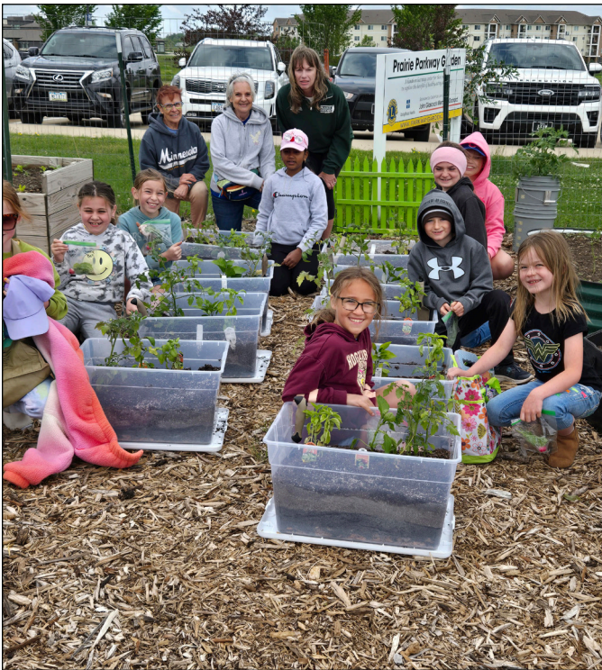
KIDS' GARDEN CAMP. Cedar Falls Lions held a Kids' Garden Camp at the Prairie Parkway Diabetes Garden for two hours each Monday in June.