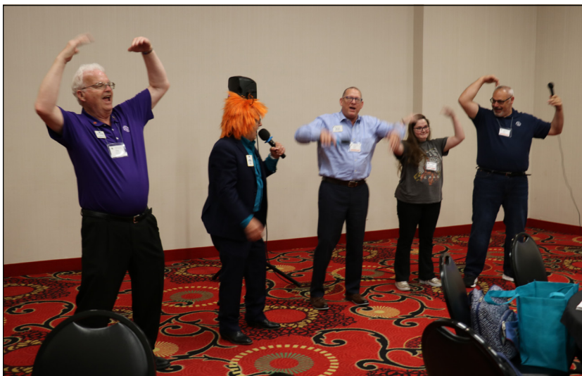
VILLAGE PEOPLE? A group of Lions performs "YMCA" on karaoke.