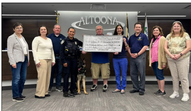
K9 ASSIST. Altoona Lions present a $5,000 check to the Altoona Police Department at a May city council meeting. The funds are to help start a K9 juvenile support team.