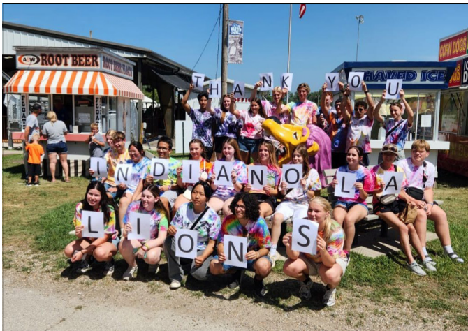
MIDWEST EXPERIENCE. Indianola Noon Lions host the 24 campers from the Iowa Lions Youth Exchange Camp at the Warren County Fair.