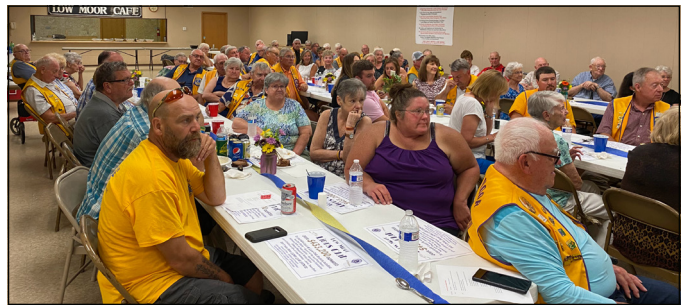
DINNER CELEBRATION. Low Moor Lions celebrate Awards Night with guests.