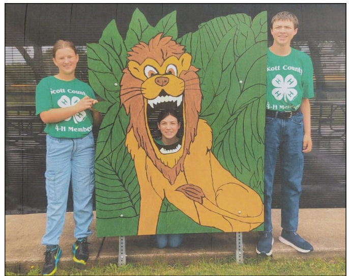
LION GIFT. Members of the Winfield Whipperwills 4H Club made a Lion in the Park for the Eldridge Lions. The Lion was installed at Sheridan Meadows Park in Eldridge – when in Eldridge, stop by for your photo op!