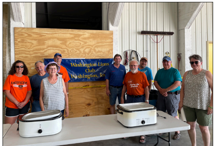
FLY-IN PANCAKES. Washington Lions Club members serve up pancakes and sausage at the Washington County Airport Fly-In.