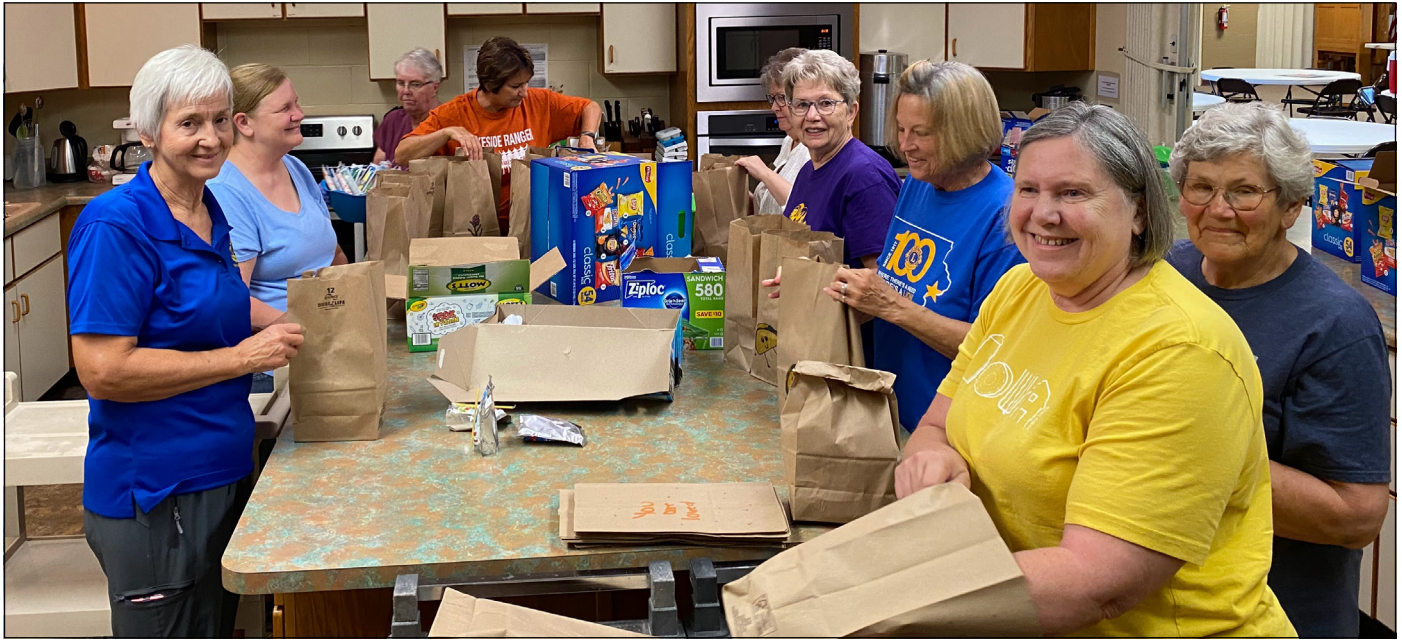
FEEDING THE CHILDREN. Eldridge Lions partnered with Eldridge Faith Lutheran Church for two days in August for the Feed Our Children lunch program feeding 150-200 kids.