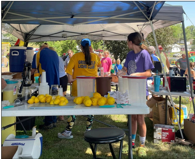
LEMONS INTO LEMONADE. Greenfield Lions make up fresh-squeezed lemonade for the 4th of July celebration in Messena.