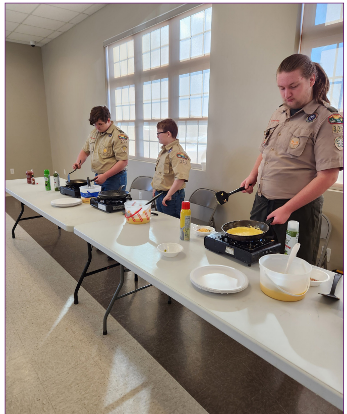
FOLDING EGGS. Boy Scouts help with the Lawler Lions Club Omelette Breakfast in February.

I will continue to visit clubs and attend any fundraising activities you may have planned. District conventions have taken some weekends and I look forward to the Iowa Lions State Convention in Cedar Falls May 5-6. It is being hosted by the Cedar Falls Noon Lions. We want great representation from our district. Wouldn't it be great to have all 42 clubs in attendance?