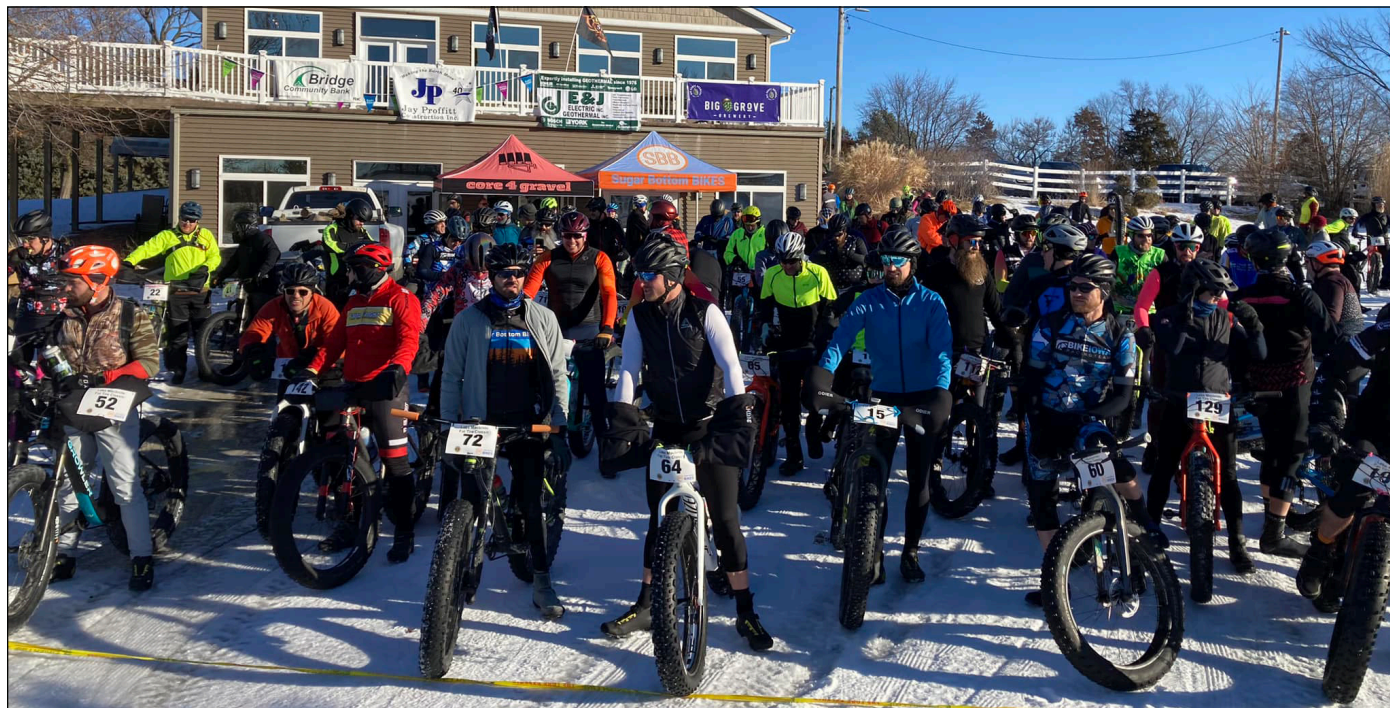
WINTER BIKE RACE. Solon Centennial Lions Club held its annual Lake McBride Fat Tire Classic, raising over $14,000 for projects in the Solon community.