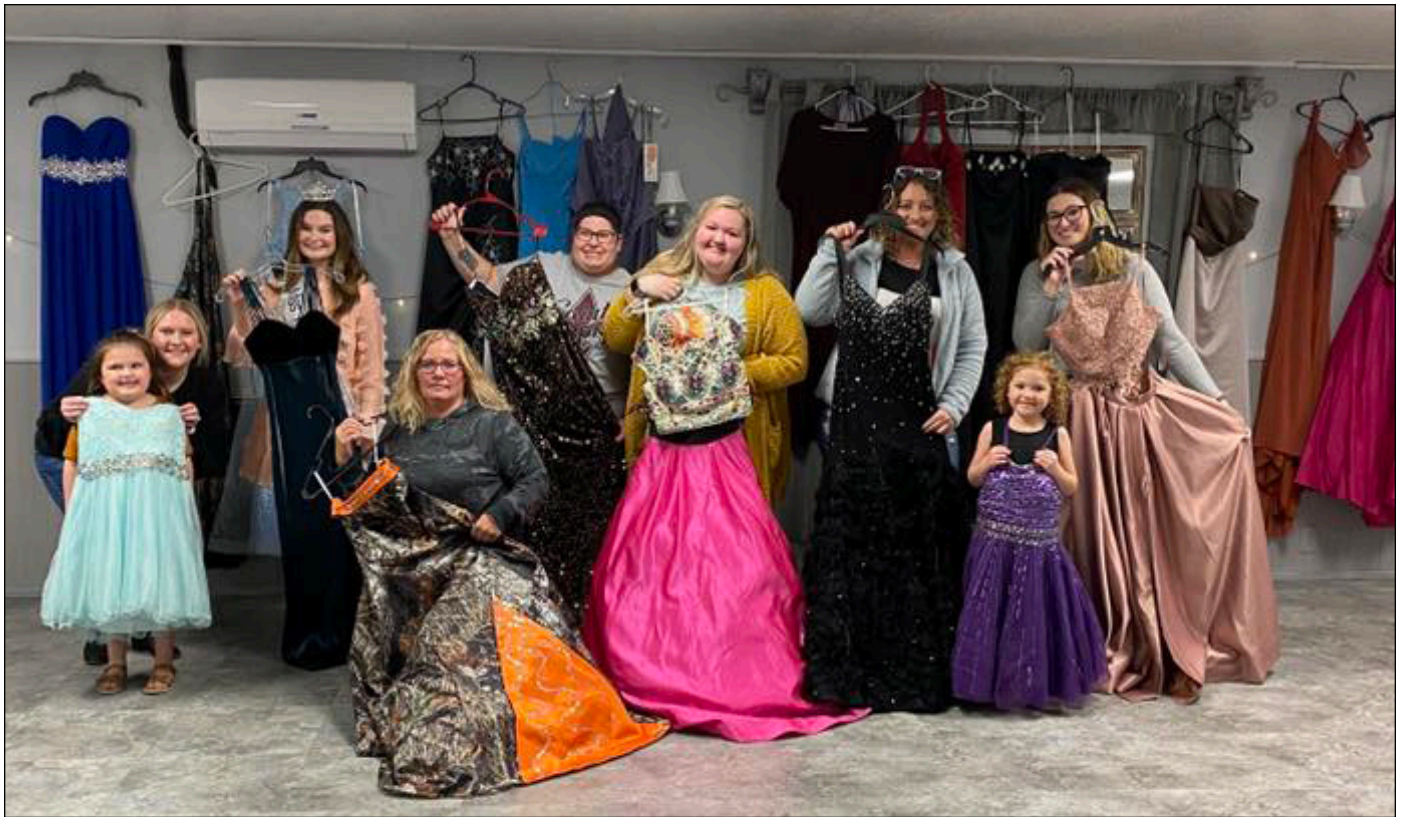
LIONS ARE MY FAIRY GODMOTHERS. Melcher-Dallas Lions Club held Operation Cinderella in February. They collected formal dresses and distributed them for free just in time for prom.