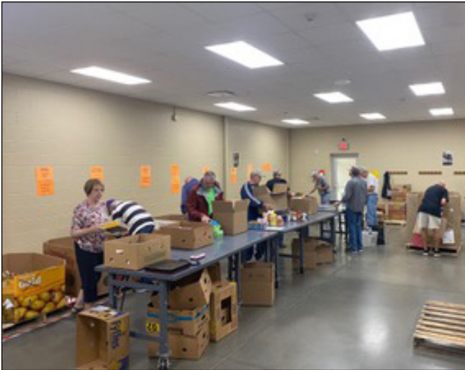
FEEDING THE HUNGRY. Cedar Falls Lions pack food at the Northeast Iowa Food Bank in Waterloo.