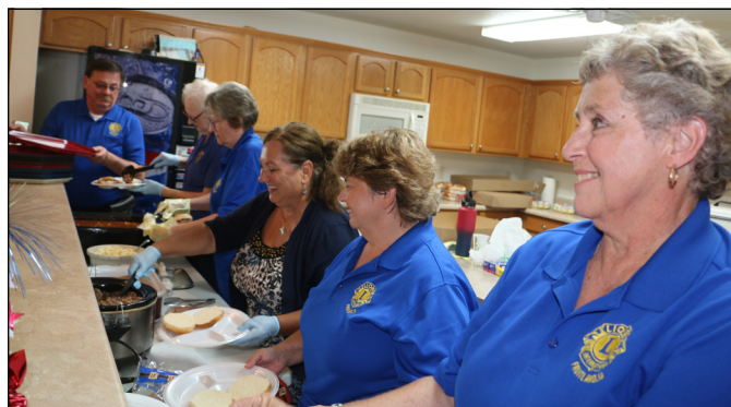
LUNCH IS SERVED. Fruitland Community Lions Club members serve lunch to those present for the dedication.

Following the dedication, a meal was served. Fruitland Community Lions went home that evening tired but happy that a long-time goal had at last been reached.