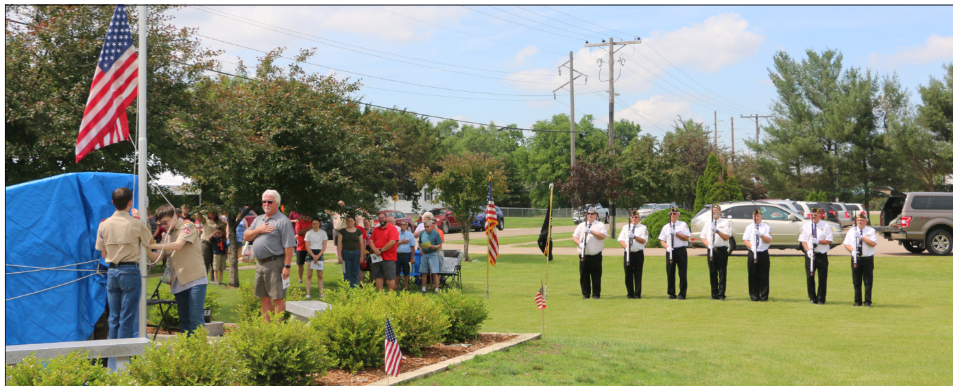
HONORING VETERANS. Boys Scout Troop 54 raising the flag at the dedication of the All Veterans Memorial while a combined VFW and American Legion Honor Guard prepares to offer a 21-gun salute.