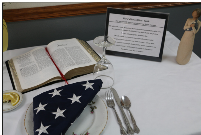
FALLEN SOLDIER. A place setting dedicated to the Fallen Soldier at the dedication of the Fruitland Community Lions' All Veterans Memorial.

Word came in April 2022 that the monument was nearing completion. After a few jumps for joy, Lion