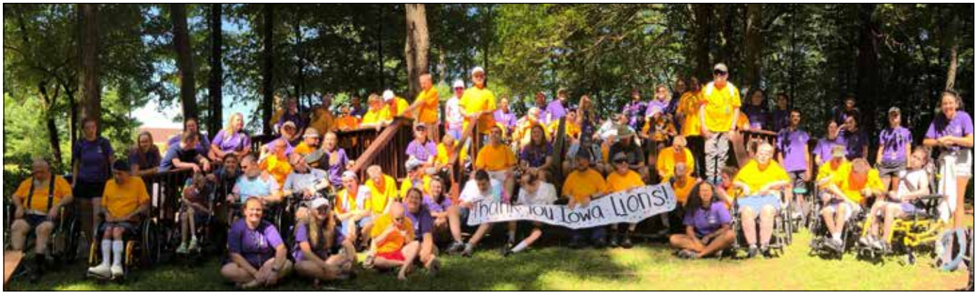
COURAGEOUS THANKS. Campers at the Iowa Lions Low-Vision Summer Camp at Camp Courageous thank the Lions of Iowa for supporting the camp each year.