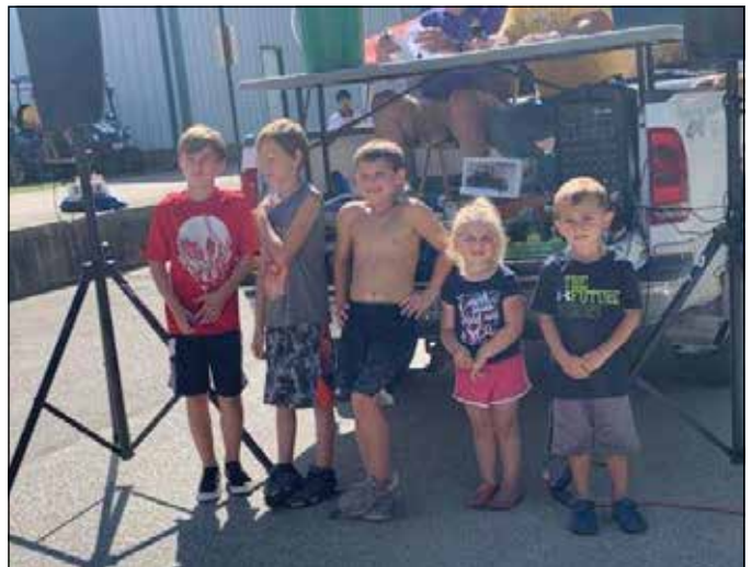
TRACTOR PULL. (Above) Winners of the Lone Tree Lions Club's annual Kiddies Tractor Pull. The club holds the event during the Lone Tree Fall Festival. This year 36 children between the ages of 2 and 12 participated in five weight classes. Each class winner received their choice of a toy tractor, a ribbon and a certificate for a free ice cream cone. (Below) The Lone Tree Lion mascot rides in the back of a pickup during the Lone Tree Fall Festival parade.