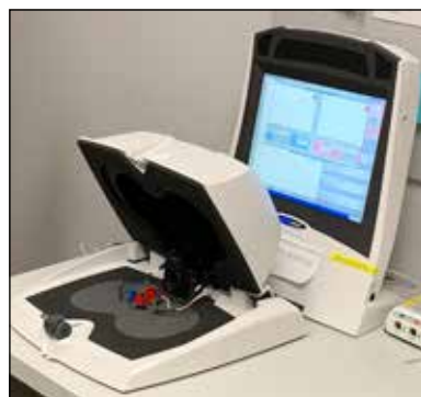
A GIFT FROM LIONS. One of the pieces of equipment funded by the Iowa Lions Foundation.

Congratulations to the University of Iowa Department of Otolaryngology for remaining a leader in the field of cochlear implant technology, and congratulations to the Lions of Iowa for having the foresight to help found this department and to continue to support it in its mission.