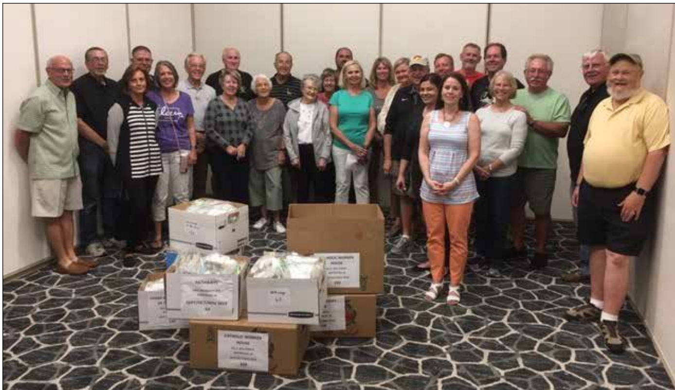
CARING LIONS. Members and volunteers at the Cedar Falls Lions Club stand behind boxes of “Packets of Care” assembled for homeless people in Black Hawk County. See the full feature story on Page 24 of this issue.