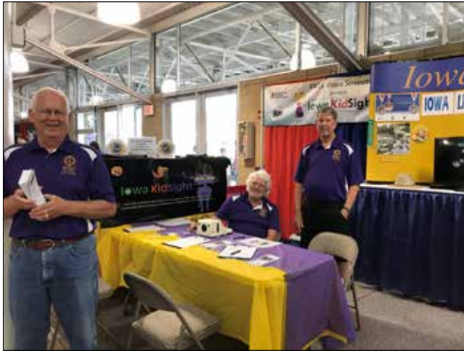
Des Moines Host Lions Club members offer vision screenings during the 2018 Iowa State Fair.