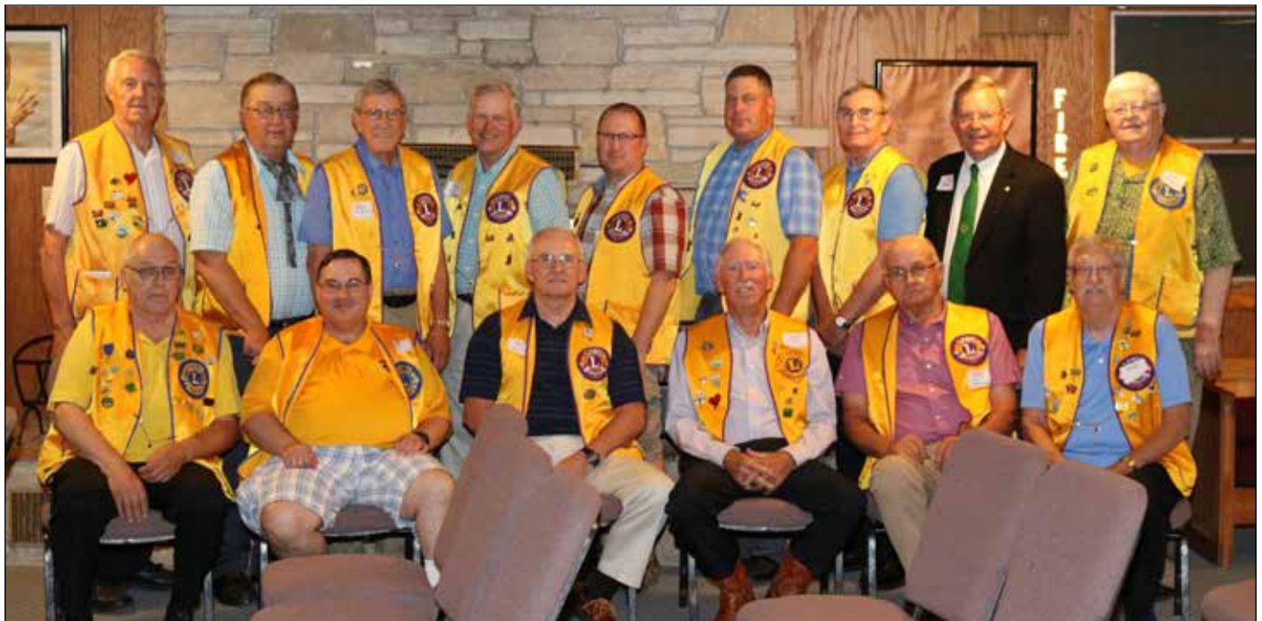
Current members of the Dayton Lions Club pose during the club's 50-year anniversary celebration.