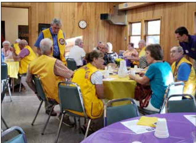
ANNIVERSARY DINNER. Members of the Dayton Lions Club visit during the club's 50th anniversary celebration.