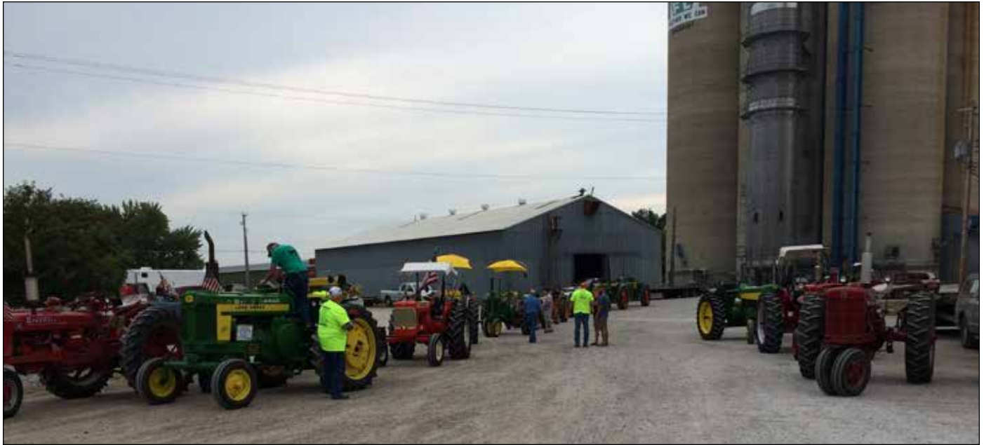
BIG TRACTORS, BIG FUN. Bondurant sponsored the 5th annual Bondurant Lions Club Tractor Ride on Aug. 4. Thirty eight tractors traveled 52 miles, including a lunch pitstop as part of the event.