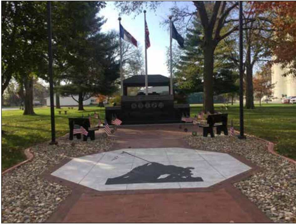
As their Level 3 Centennial Community Legacy Project, Prairie City Lions built a Veterans Memorial to honor area veterans from all conflicts. The club has completed all three levels of the Lions Centennial Community Legacy Project.