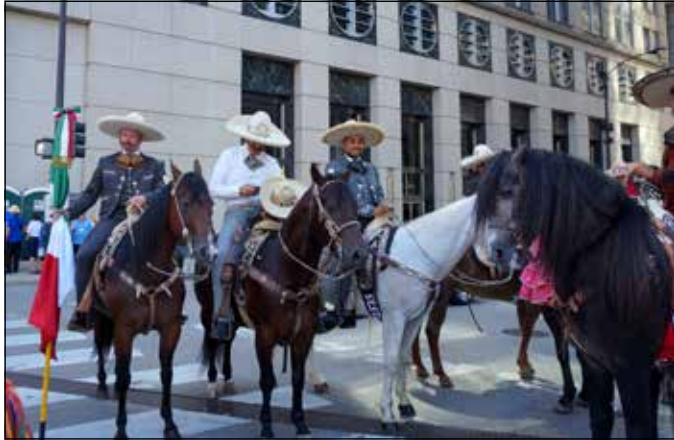
ABOVE: A cavalry of Lions from Mexico. BELOW: Lions from Indonesia dressed in colorful costumes.