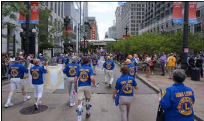
Iowa Lions marching down State Street in Chicago.