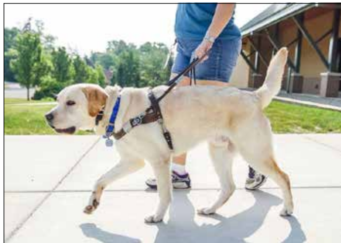
Leader Dog Puppy Buddy working with a sighted trainer at Leader Dogs for the Blind in Rochester Hills, Mich.

We are in need of several Lions for positions within our district. We have a vacancy needing to be filled for a 2nd VDG. We need two more zone chairs. It would be great to have a Public Relations chair, a Hearing Preservation/Awareness chair, a nominations chair, and a Young Adult Member Specialist. A 2nd VDG needs to have served in the role of zone chair. The zone chairs need to have served as a club president. Zones 1 and 4 need zone chairs. Clubs in Zone 1 are Agency, Albia, Blakesburg, Centerville, Corydon, Moulton (Moulton Lioness), Ottumwa Noon, Ottumwa Evening; Zone 4 includes Iowa City, Lone Tree, North Liberty, Oxford, Victor, Williamsburg, Solon Centennial and