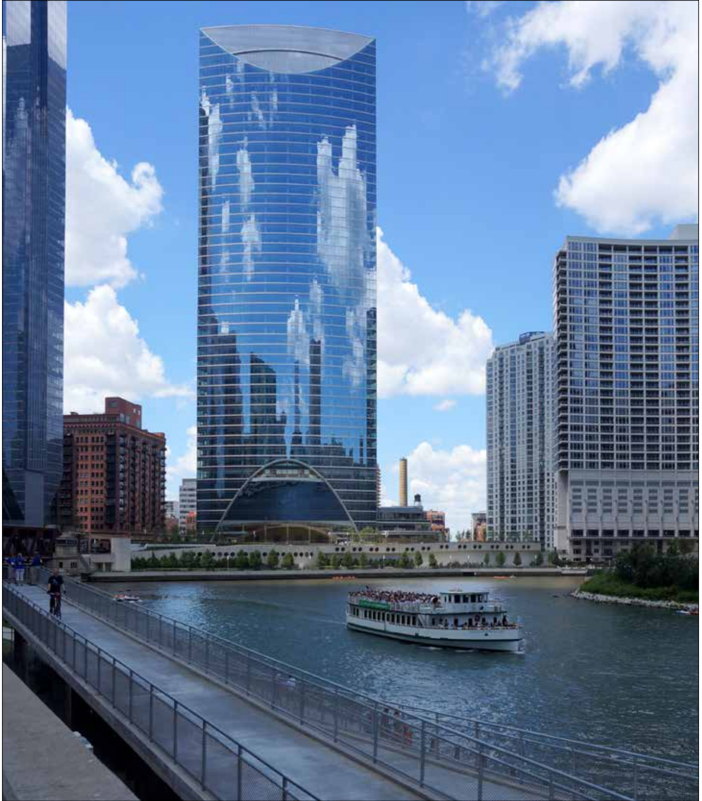
A View of the Chicago River during the Lions Clubs International Convention in Chicago, Illinois. Look at skyline reflected in the skyscraper in the middle.