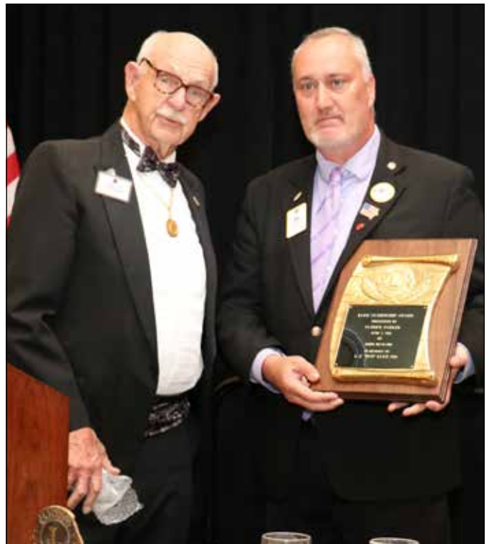
See more photos in the digital version of The Iowa Lion online at iowalions.org/theiowalion