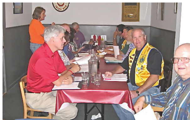
Pictured above is the 9NE cabinet getting ready to order Gunder burgers at the Oct. 9 cabinet meeting at the Irish Shanti Restaurant in Gunder. Yummy!