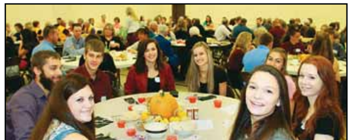
A few of the many Leo club members at their charter banquet.