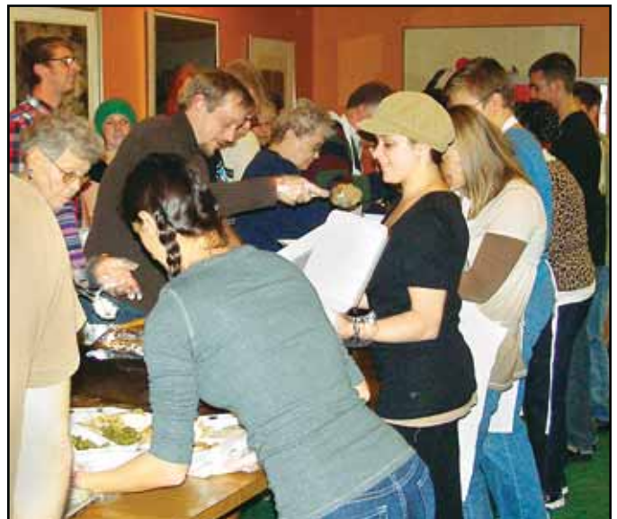
A few of the many volunteers at work preparing carryout meals.