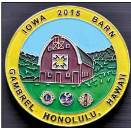
2015 MD 9 STATE PIN

The Prestige pins are available only from the Lion Pin traders Club of Iowa for $3.00 each plus shipping ($1.50 for the first pin and $0.50 for each additional pin). Send your order and a check to PDG Charles Boeding, 107 Sunnyside Drive, Montezuma, Iowa 50171, and you will be in the pin trading business.