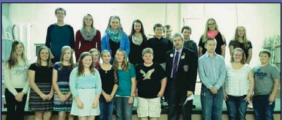
Officers and members of the new Leo Club chartered by the Preston Lions. The club chartered with 28 members.

9EC District Convention – April 24 & 25, 2015