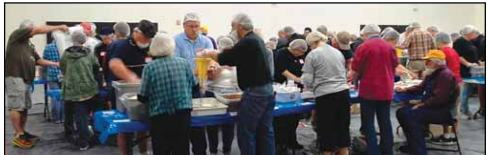
Part of the volunteers packing 84,000 plus meals at the West Branch Hoover Hunger Project.