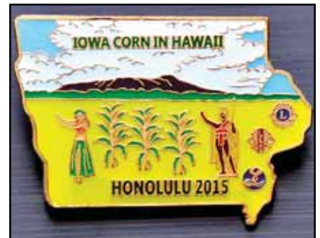
2015 IOWA PRESTIGE PIN